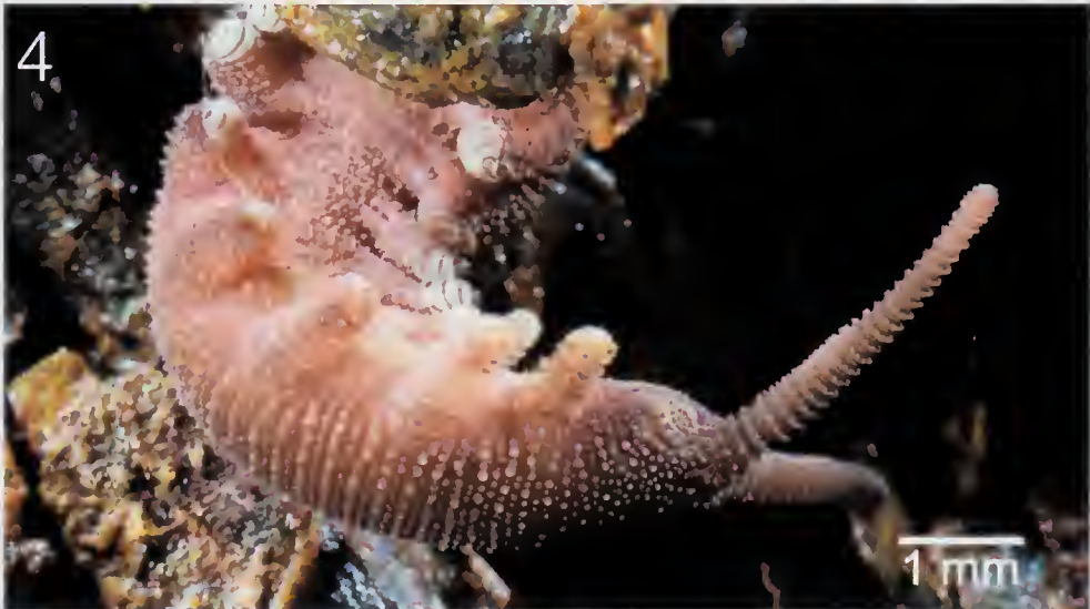
Figures 2–4. Live female of Mesoperipatus tholloni . Figure 2. Whole animal in dorsal view. Figure 3. Anterior part of the animal in dorsolateral view. Figure 4. Ventral side with spinous pads in detail.